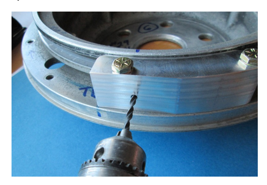
This hole is for the #1 trigger magnet

5. Use the supplied #29 drill to drill through the drilling block and flywheel as shown below. Lubricate the drill and remove frequently to clean out the chips. Mark the flywheel close to the hole as "1T" with marker.